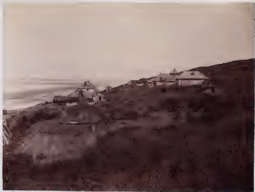
Mushagak. Upper Part